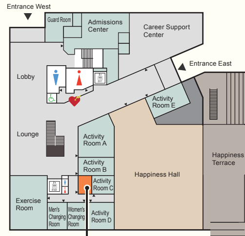
The Student Accessibility Office