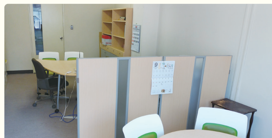
Kyoto Kameoka Campus