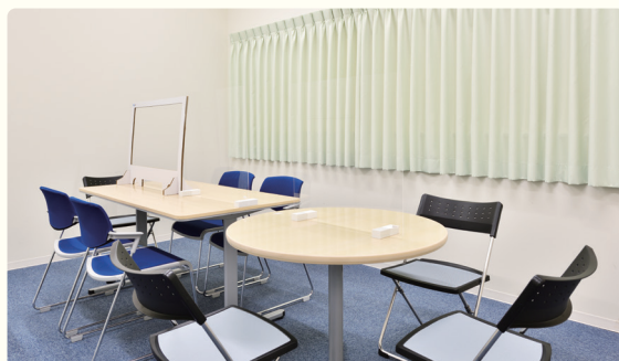
Rest room (Kyoto Uzumasa Campus)

For students who have difficulty in attending lectures or practical training, we provide support, representation, cooperation, and consultation with the Nurse's Office, Student Counselor's Office, and related faculty and staff.