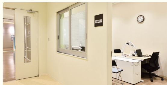
Kyoto Uzumasa Campus

Do you have any problems with your lectures or university life?